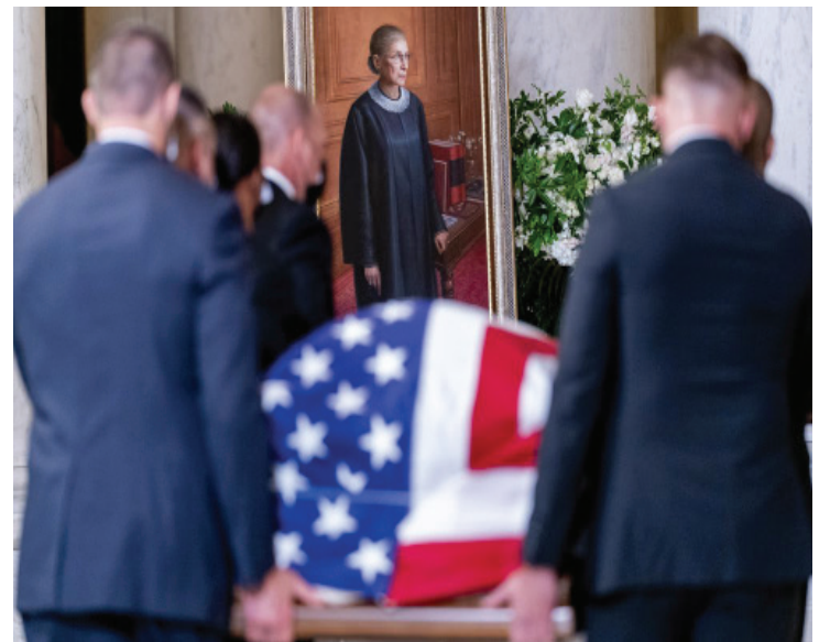
FUNERAL CEREMONY IS HELD FOR SUPREME COURT JUSTICE, RUTH BADER GINSBURG.

The Associated Press contributed to this article.