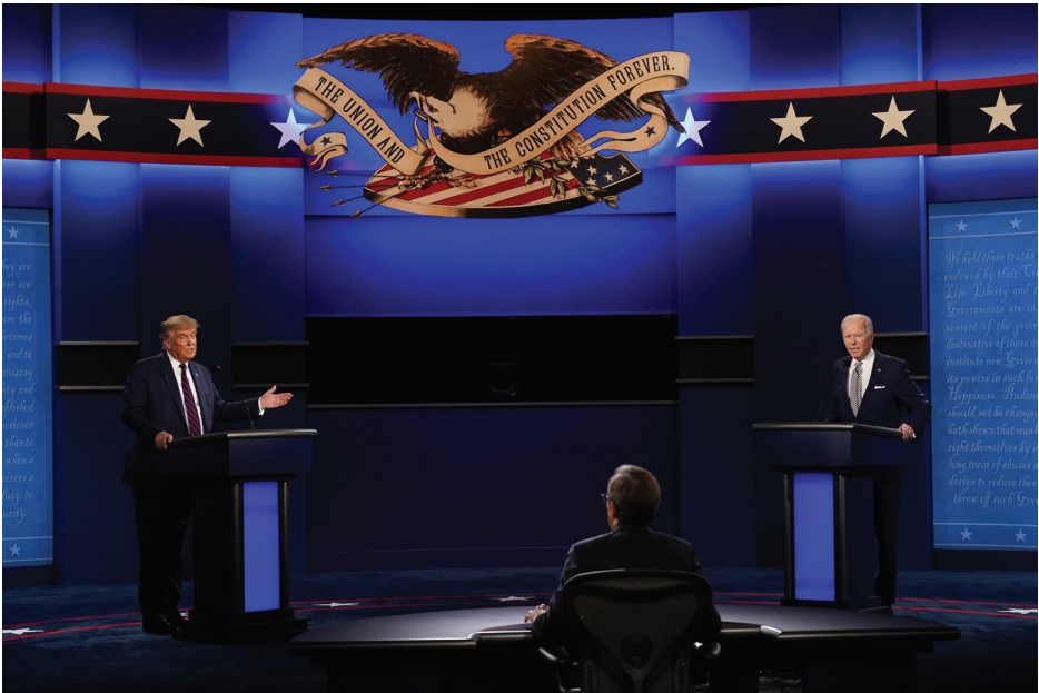
THE SECOND PRESIDENTIAL DEBATE HAS BEEN CANCELLED DUE TO THE UNCERTAINTY SURROUNDING PRESIDENT TRUMP’S HEALTH AFTER HIS COVID-19 DIAGNOSIS.

The United States 2020 presidential election is scheduled for Tuesday, Nov. 3.