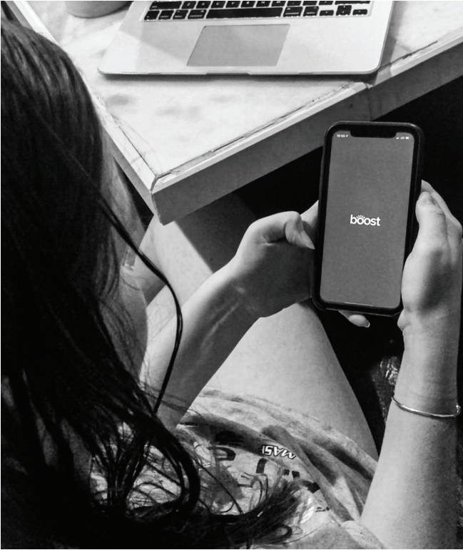
THE BOOST MOBILE APP ALLOWS STUDENTS TO ORDER THEIR FOOD AHEAD OF TIME IN ORDER TO AVOID WAITING IN LINE.