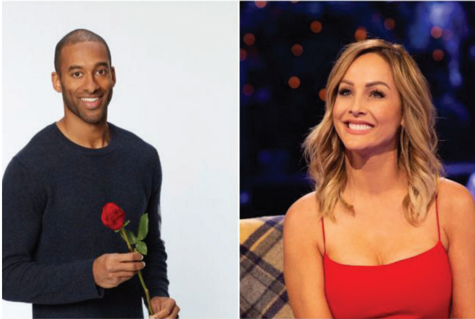
YAHOO NEWS THE NEW SEASON OF “THE BACHELORETTE” PREMIERED ON ABC ON OCT. 13 AT 8 P.M.

“The Bachelorette” airs Tuesday nights at 8 p.m. on ABC.