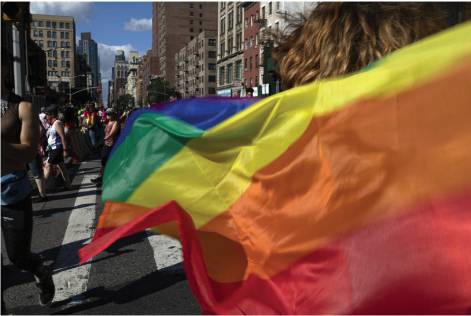
SACRED HEART HELD A NATIONAL COMING OUT DAY RALLY ON OCT. 12 MARKING THE FIRST TIME THAT THE DAY WAS CELEBRATE ON CAMPUS.