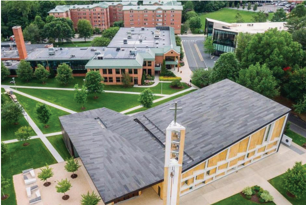
SACRED HEART UNIVERSITY PREVIOUSLY, SACRED HEART HAD PLANS TO ACQUIRE A PORTION OF THE UNIVERSITY OF BRIDGEPORT, BUT HAS ANNOUNCED THAT THEY WILL NO LONGER GO THROUGH WITH THAT PLAN.