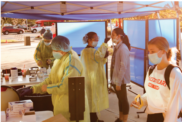
SACRED HEART ANNOUNCES THAT THEY WILL BEGIN USING SALIVA DIRECT AS A MEANS OF TESTING STUDENTS FOR COVID-19.