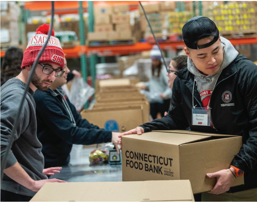
SACRED HEART UNIVERSITY SACRED HEART STUDENTS FIND DIFFERENT WAYS TO GIVE BACK TO THE LOCAL FAIRFIELD AND BRIDGEPORT COMMUNITIES THROUGH VOLUNTEER SERVICES.

“Due to the coronavirus pandemic, our philanthropy plans were derailed just like a lot of other people’s plans. We usually do a powderpuff event in the fall where we have all the sororities make football teams and play in a tournament. Each sorority pays money to make a team, and the proceeds go to the juvenile diabetes resource fund. Since we couldn’t do this, we are hoping to do our Haircuts for Heroes event, where people pay money to have their names entered in a raffle and three winners get to shave a brother’s head, and the proceeds of this go to military heroes.” Even with the current pandemic, Sacred Heart University is pushing through and still making a massive effort to allow students to be involved and give back to the local community.