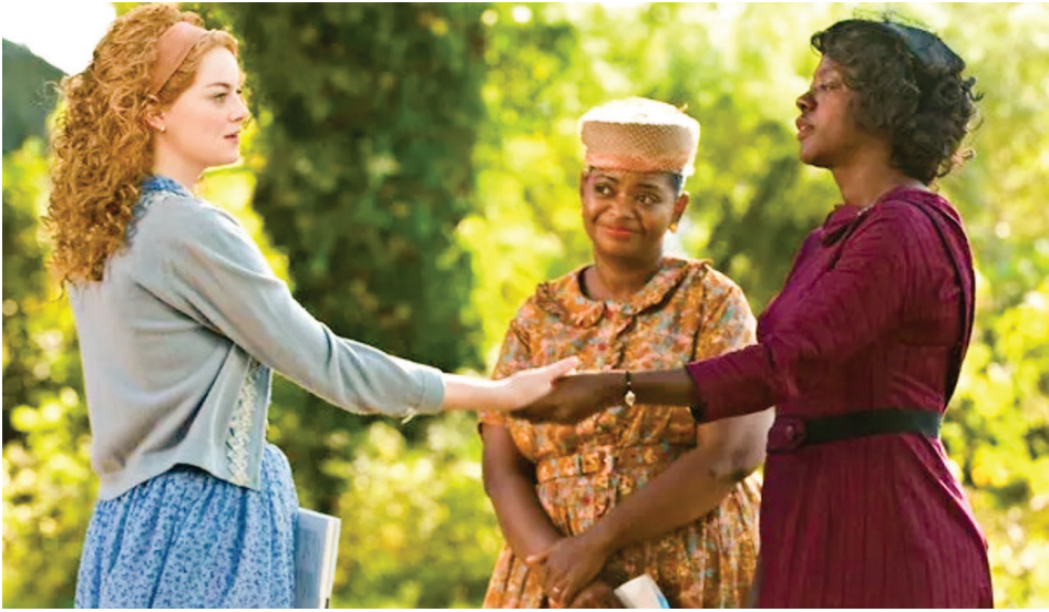
NEW YORK TIMES THE FILM INDUSTRY IS BEGINNING TO BLUR THE LINE BETWEEN FILM AND INJUSTICES; SPEAKING ON RACIAL ISSUES GOING ON IN THE WORLD.

“When I watched ‘The Help’ in high school, I was shocked and learned more from it than any textbook in history class,” said Bodak. “Seeing injustice acted out put things in perspective for me, which I think is why the film and other films are so influential.”