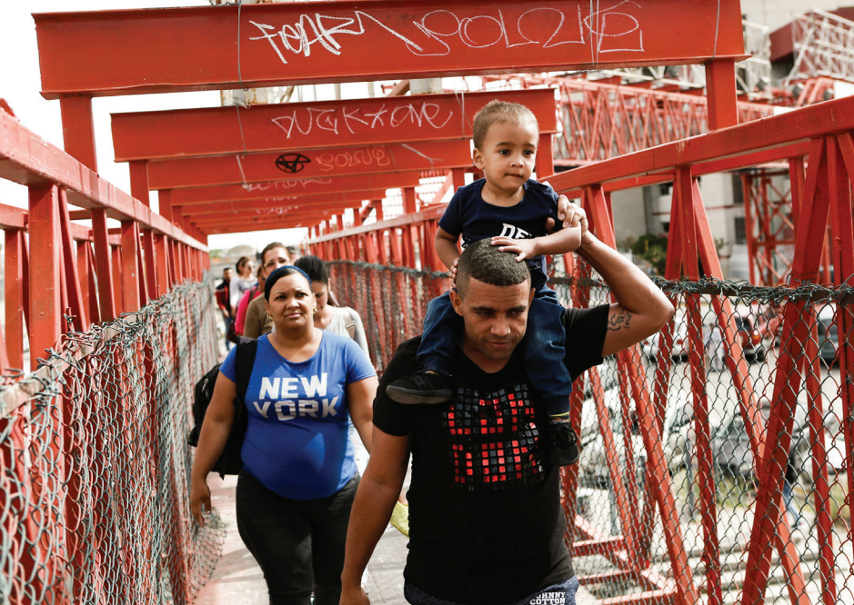
ASYLUM SEEKERS ARE RUSHING TO REGISTER FOR U.S. BORDER PROCESSING AFTER FLEEING FROM CENTRAL AMERICA, A LENGTHY PROCESS THAT THE U.S. GOVERNMENT IS TRYING TO ACCOMMODATE.