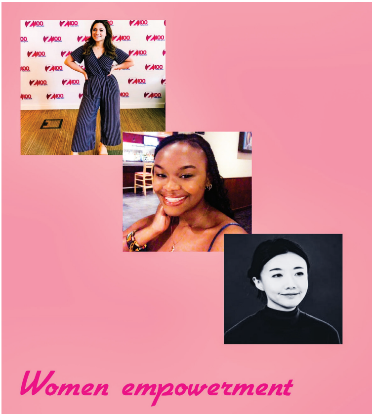
VARIOUS WOMEN SPEAK ABOUT THEIR ROLES IN THE MEDIA WORLD AND HOW THEY SEE WOMEN IN GENERAL BREAKING THE GLASS CEILING AND THEIR HOPES FOR THE FUTURE.