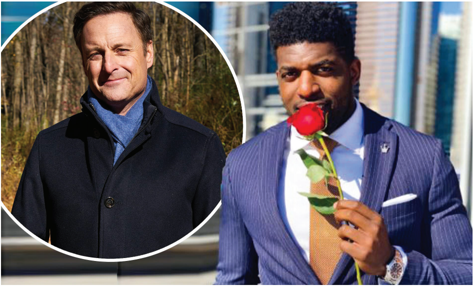
DAILY MAIL TELEVISION SHOWS ARE TAKING THE TIME TO SPEAK ON INJUSTICES IN THE WORLD AND “THE BACHELOR” HAS TAKEN EXTRA TIME TO MAKE CHANGES WITHIN THEIR FRANCHISE.