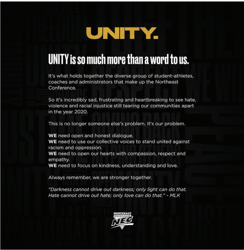
THE SACRED HEART WOMEN'S BASKETBALL TEAM IS DOING THEIR PART TO RAISE AWARENESS IN CONJUNCTION WITH THE BLACK LIVES MATTER MOVEMENT.